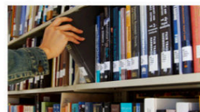
Library Book Management