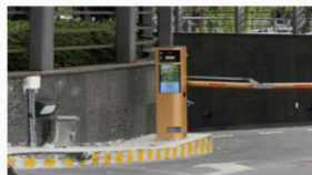
Automotive and Transportation