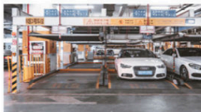
Parking lot Management