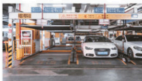
Parking lot Management