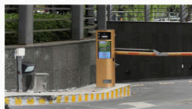
Automotive and Transportation