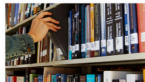
Library Book Management