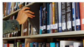
Library Book Management