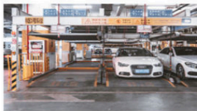
Parking lot Management