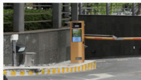
Automotive and Transportation