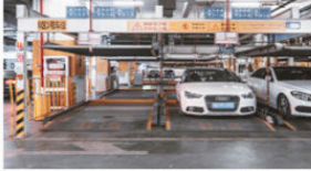
Parking lot Management