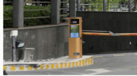
Automotive and Transportation