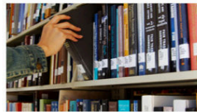
Library Book Management