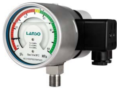
ZMJ100PR Density Monitor