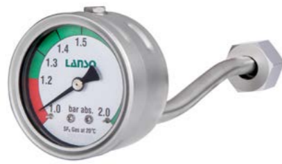
KL60 Density Meter

KL 60 Density Meters are used to monitor SF 6 gas density in sealed tanks. They are applied to indicate gas density. They are designed to monitor Medium Voltage systems.