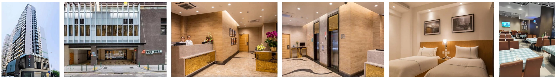
Hotel Jinjiang Inn Border Gate