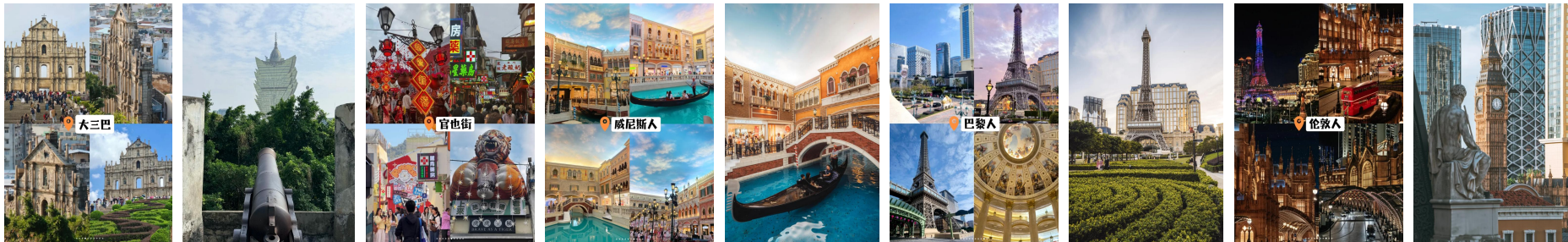
Tour Related attractions