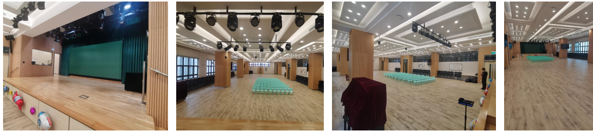
Competition Venue Ilha Verde Secondary School