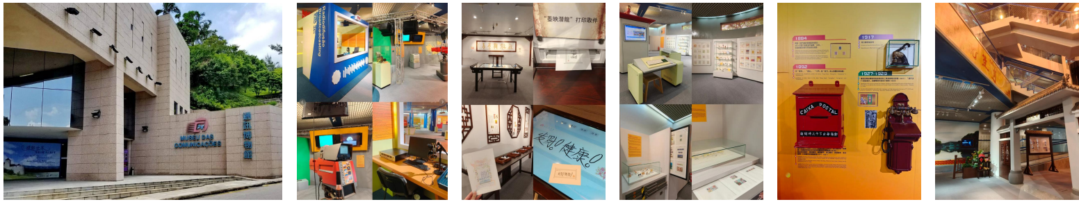
Museum Communications Museum of Macao