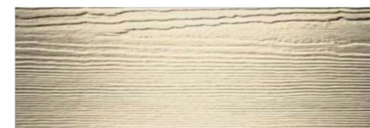
Natural Cedar Texture