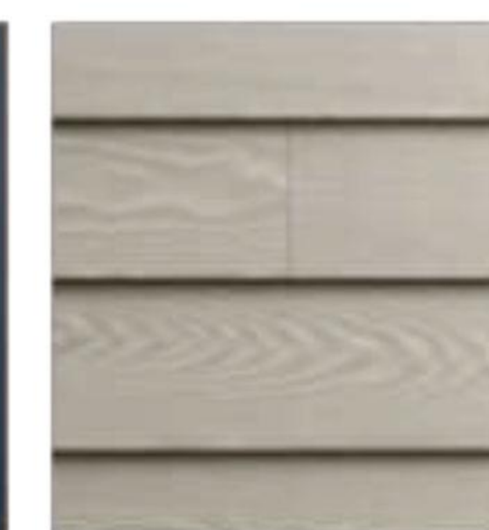
LEAO® Square Edge Wood Grain Plank Horizontal Stacking