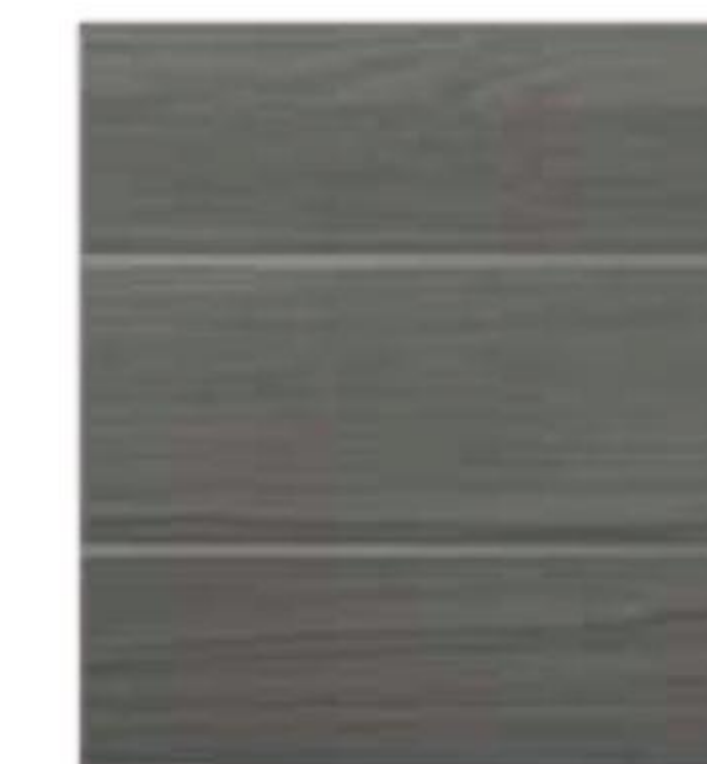
LEAO® Lock Edge Wood Grain Plank Horizontal Installation

Using a seamless connecting plank with lock edge, you can also use horizontal and vertical installations.