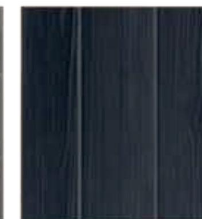
LEAO® Lock Edge Wood Grain Plank Vertical Installation