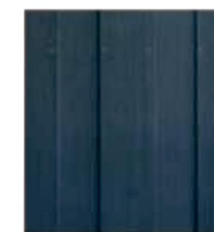
LEAO® Square Edge Wood Grain Plank Vertical Installation

Use square edge plank for classic exterior wall finishes, using vertical joining and horizontal folding.