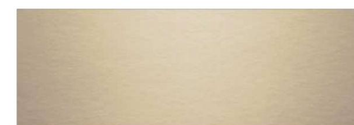
Smooth or Sand Texture