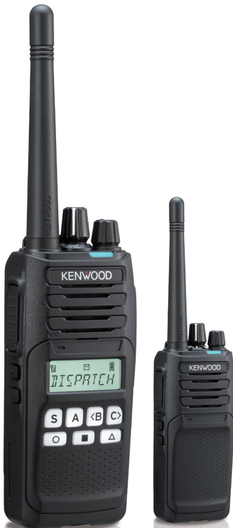
Standard Keypad model

If you are thinking of harnessing the latest digital protocols – NXDN or DMR – to enhance business efficiency or FM analog for its simplicity, the NX-1200/1300 has you covered. Our One-“K”-Fits-All solution offers the widest selection of two-way radios for everyday use. The model matrix also includes basic and keypad variations, with or without a high-contrast backlit LCD. Other features include a 7-color LED indicator and the popular KENWOOD 2-pin audio accessory connector. Plus, mixed-mode operation ensures seamless integration with legacy radios while smoothing the onward migration path to digital. But whatever your specific needs, audio quality is what determines clear voice communications – which is why KENWOOD radios are used under the most grueling conditions, like the cockpit of a racing car. Thanks to our extensive experience with professional systems, reliability is second to none. So whatever your radio requirements, KENWOOD’s NX-1200/1300 offers a single platform that’s right for you.