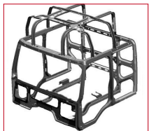
Keel Frame Cab Structure