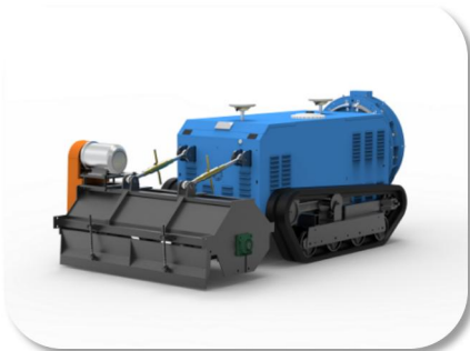
Swing Blade Weeding

Equipped with an intelligent control system, it supports remote control, autonomous operation, and path planning, ensuring safe and efficient performance. The adjustable chassis height allows it to adapt easily to varying terrains.