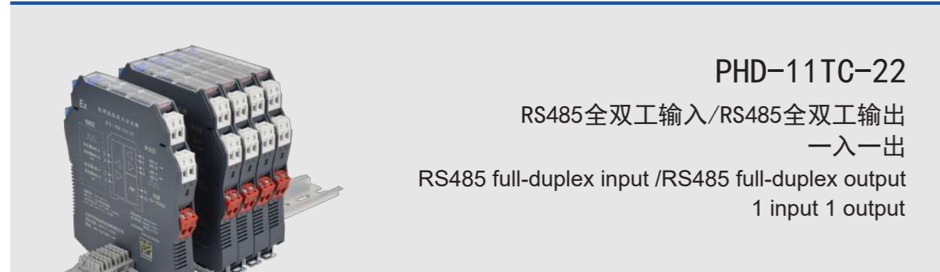
PHD-11TC-22 RS485全双工输入/RS485全双工输出 一入一出 RS485 full-duplex input /RS485 full-duplex output 1 input 1 output