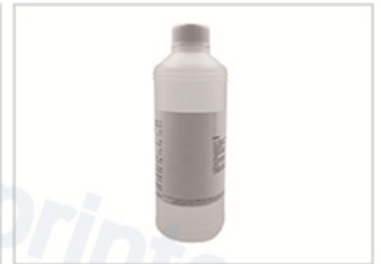
Print head cleaning