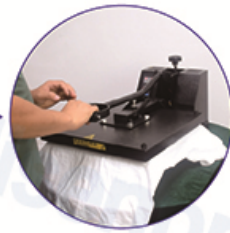
Press press transfer printing