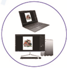
Computer design drawings