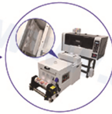
dusting, shaking powder, drying