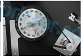
Double servo motor