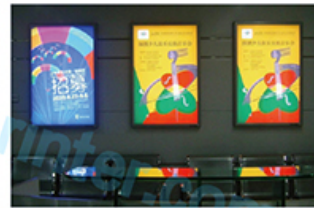
Advertising light box