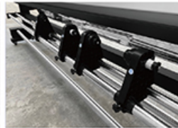
Segmented drying system