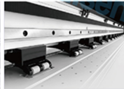
High-precision guide rail