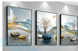
Photo paper/hanging picture