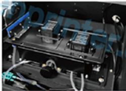
Automatic lifting ink stack