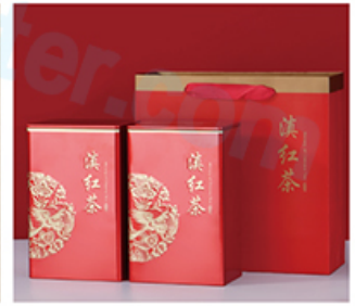
Aluminum and iron products