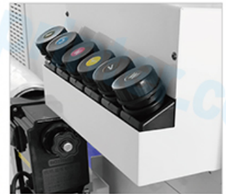
First -class ink cartridge